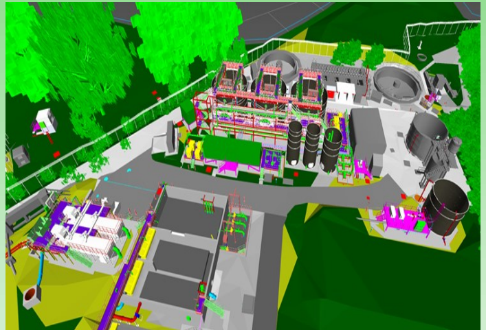
Cutting Edge Design